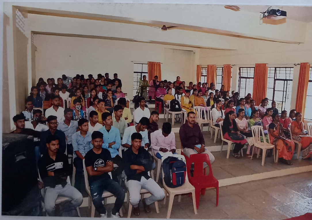
Student Attended this Lecture.